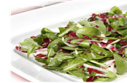
Shaved fennel salad

Our selection of cold salads are presented to you in plastic oval serving bowls. Each bowls serves 8-10 with dressing on the side to be added at dinner Time